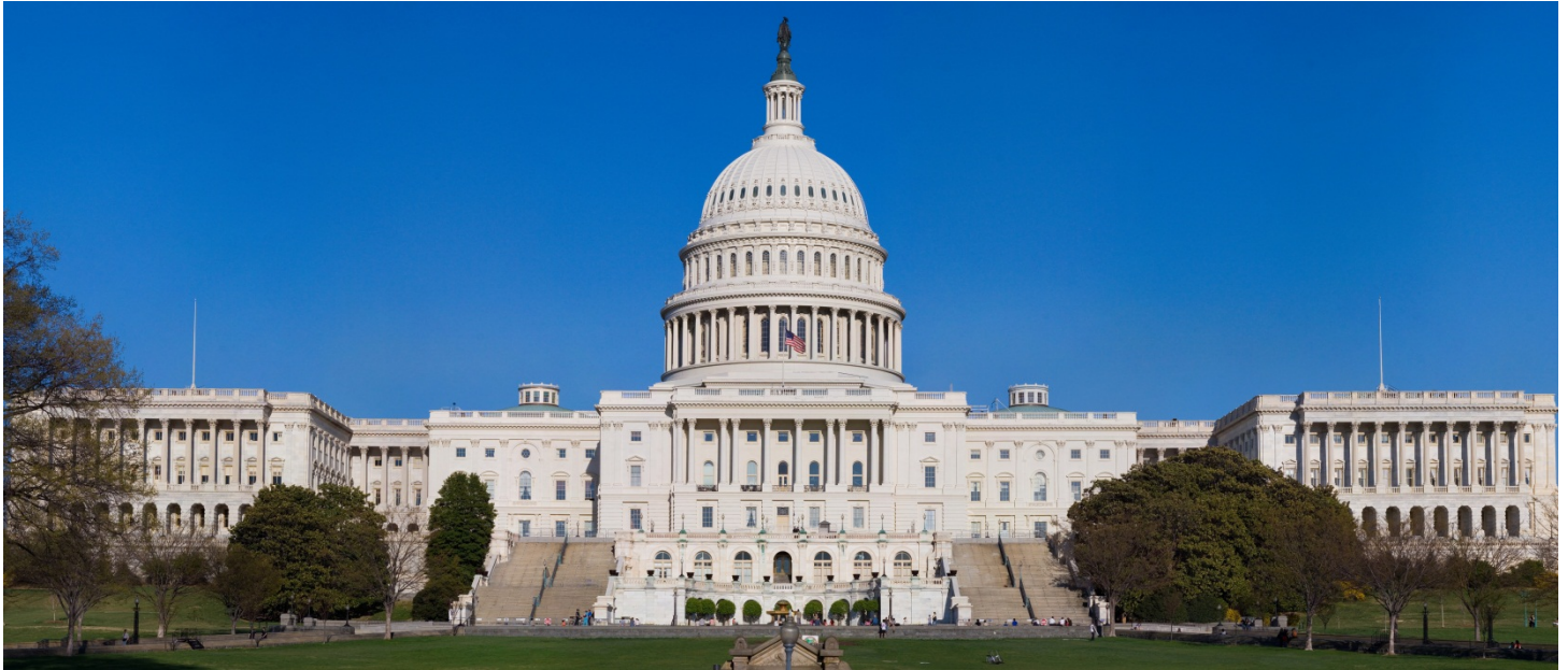
The US Capitol – Washington DC