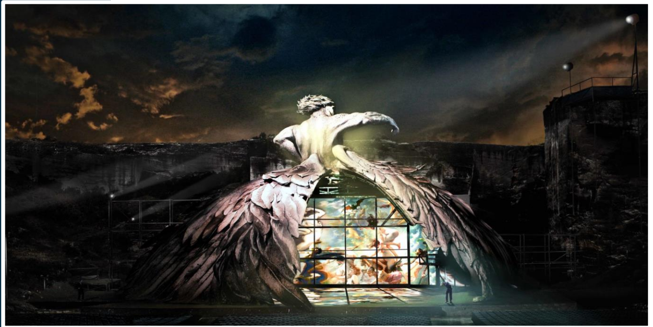
Picturall quad-output media servers drive a 340 m 2 LED wall for Puccini's Tosca in a Roman quarry in St Margarethen (Austria)