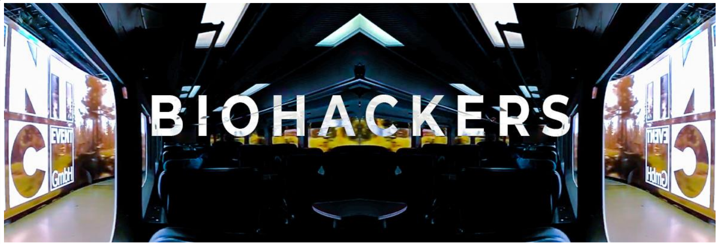
Picturall Pro media servers help Rent Event Tec drive LED videowalls for "BioHackers" streaming TV series (Germany)