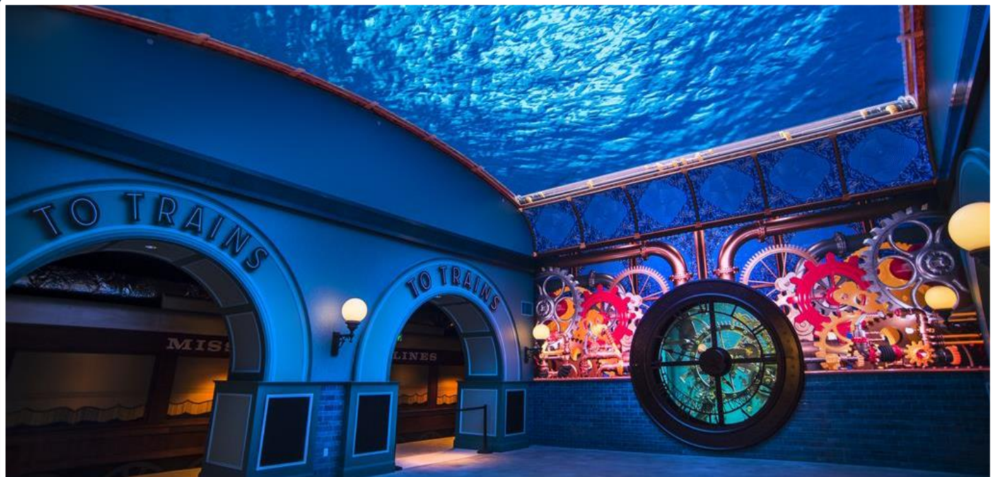
Picturall Pro media server drives award-winning entrance experience at new St. Louis aquarium (USA)